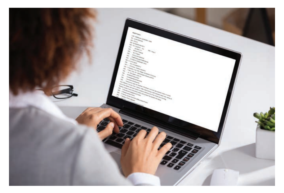
Ensure high-quality data with Brodart's book-in-hand cataloging.

Let Brodart become an extension of your staff. We'll ensure your records adhere as closely as you want to your existing standards. That leaves you to do as much — or as little customization as you choose.